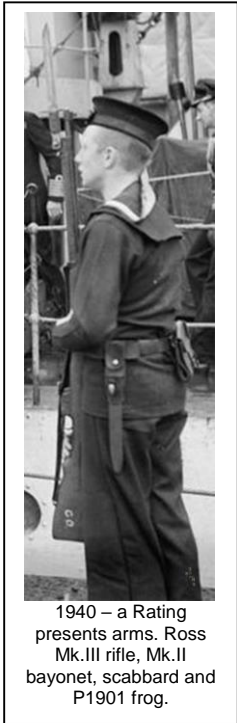
1940 – a Rating presents arms. Ross Mk.III rifle, Mk.II bayonet, scabbard and P1901 frog.

The British Home Fleet was based at Scapa Flow in Scotland during the Great War and, as the RN were issued with Ross rifles, it would seem reasonable to conclude that this bayonet and frog have always been together.