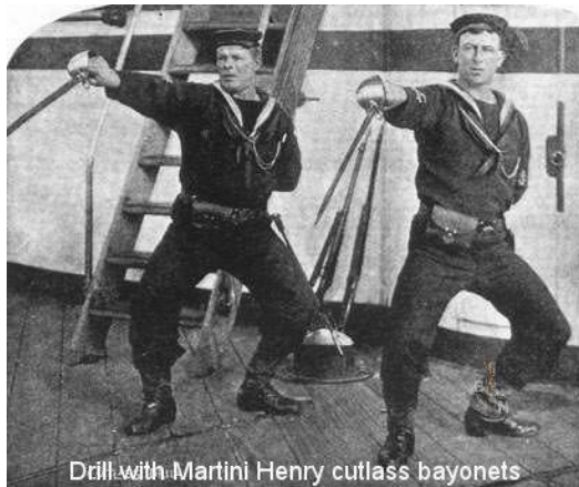
Drill with Martini Henry cutlass bayonets

First issued to carry cutlass swords or the P1859 and P1871 Cutlass bayonets, the later Marks were intended only for Martini Henry sword bayonets, and finally the P1888 short sword bayonets.